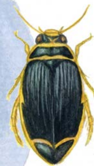
Great diving beetle